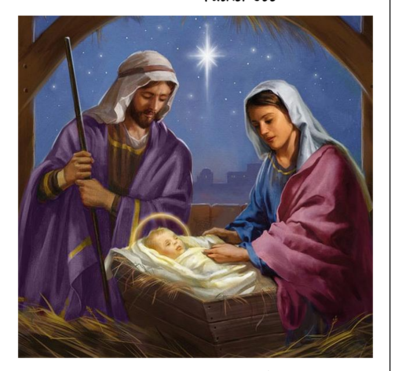
May you have the gift of Faith, the blessing of Hope and the peace of His Love. Merry Christmas!